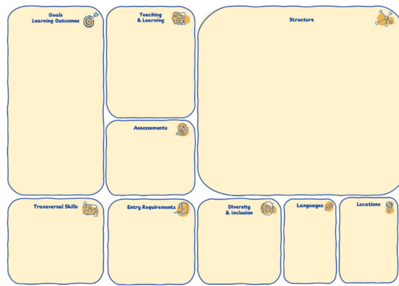
Figure 1. Curriculum canvas, as a template with nine components.

The curriculum canvas is provided (Figure 1), either empty as in the figure, or with brief text describing each component, or a real curriculum to be tested by the players.